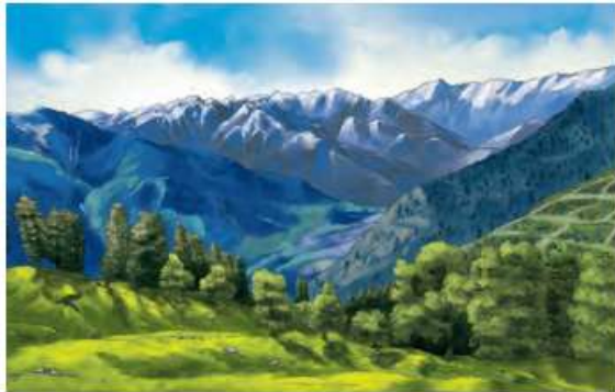
A mountainous region

Ans. Science is a way of thinking, observing and doing things to understand the world we live in and to uncover the secrets of the universe.