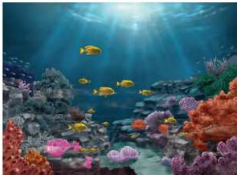
An underwater view of an Ocean